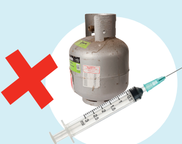
Hazardous and medical waste